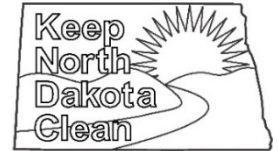
Keep Our Rivers & Lakes Clean

SPONSOR: ND Department of Transportation.