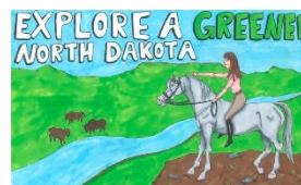
Eighth Grade Sawyer - Moffit