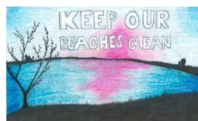
Seven Grade Jessilee - New Salem / Almont