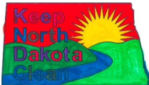
Special Abilities Lexie - Minot