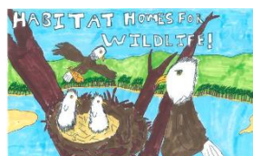
Fourth Grade Bridger - Moffit