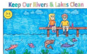
Pre-K Emily - Mott / Regent